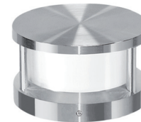
LS592 Balitza Micro

Any luminaire can become hot - take care with appropriate use and placement