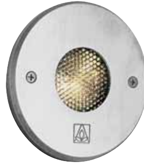
LS381 Melia II

NOTE: Product specifications are subject to change without notice. Any luminaire can become hot - take care with appropriate use and placement.