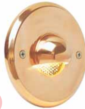
LS642 Copper Hood